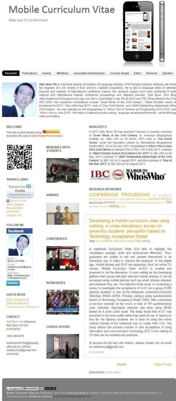
Fig. 1 Screen shot of mobile Curriculum Vitae or m-CV ( http://m-curriculumvitae.blogspot.com ) in Web view format