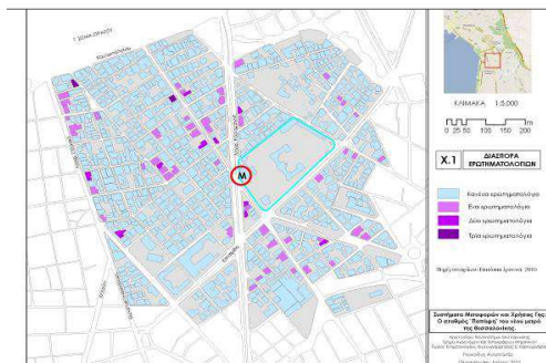
Fig. 2 GIS map illustrating the dispersion of enterprises' questionnaires

The questionnaire is separated in two parts, with the one describing the attributes of the enterprise and its staff, and the other part the stated preferences (SP) of the persons involved. More specifically, the first part records both quantitative and qualitative data such as the company's type, the state of ownership (rented or owned property), year and reason(s) of installation, number of employees and average number of clients daily, the transport mode that they use to reach the company etc. The second part consists of the interviewees' SP towards the potential increase of the volume of clients due to the operation of the metro station, the degree of the future development of the area and potential upgrade of the quality of life there. The questions have in their vast majority, predefined answer boxes that in some cases cover a range of potential answers (e.g. the question about the salary), in other cases, especially in the SP part, they indicate the degree of agreement with the statement. The questions that had "open type" answers were coded afterwards during office elaboration.