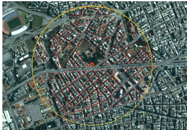
Fig. 1 Research buffer zone of 500 m. around Papafi Station (Google Earth, 2010)

Papafi station is situated in the area of East Thessaloniki, within a walking distance from the so – called "historic centre" of the city. It is the 7th station of the metro line. The buffer zone of the research was defined as the area included in a radius of 500 m around the location of the station's future infrastructure (Figure 1). The limits of the buffer zone are defined by the surrounding streets. The criteria for the choice of the Papafi Station as the case study of this research were the location of the station within the urban tissue of Thessaloniki, the existing transport connections of the area, as well as its urban character. The area is characterized by dense urban tissue, compact building activity, extended land segmentation and lack of open public spaces.