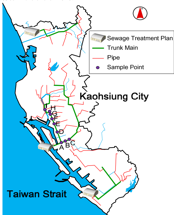
Fig. 1 Kaohsiung City sanitary sewerage and nine sample points [4]

Kaohsiung City is a coastal city with a population of about 150 million and becomes the transportation and commercial center in southern Taiwan. Besides, five industrial zones, two export processing zones, and other several important factories such as Taiwan Steel Corporation, Taiwan International Shipbuilding Corporation and Chinese Petroleum Corporation etc. turn Kaohsiung City into an industrial center as well. However, accompanying with the rapid development of Kaohsiung City, environmental pollution seriously affects the life quality of the residents. Before 1989, the domestic sewage and industrial wastewater directly or indirectly discharged into the river and threaten human and environmental health because the sewage connection rate in this city was only 6.5%. Therefore, at that time the Kaohsiung City Government launched the Kaohsiung City sewage system, which is shown in Fig. 1. The sewage connection rate in this city was upgraded to 60.89% in the end of 2010.