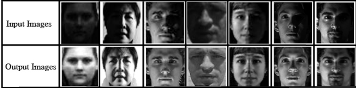
Fig. 5. Recovered images for variant faces from a single 50 \times 50 input image.