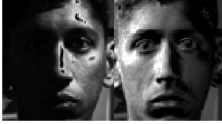
Fig. 1. Face relighting by using 2D spherical spaces on a single input image of size 50 \times 50 pixels.

face automatically and in real time processing speed, figure.1.