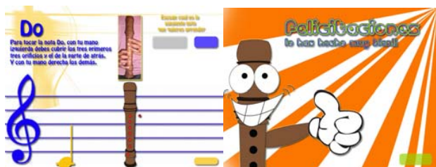
Fig. 3 Images from the software application for the Virtual Flute

The Fig.2 shows two of the ten children who have played the flute and have learnt the basic musical notes