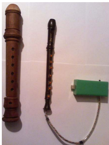
Fig. 1 Virtual Flute

The figure above shows the two designed flutes the one in the left is a own model in which the electronic components are inside. The other one in the right is a traditional flute and the electronic components are in the little green box next to it.