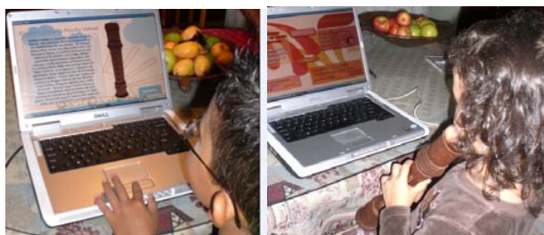
Fig. 2 Children playing the Virtual Flute

The figure above shows the two designed flutes the one in the left is a own model in which the electronic components are inside. The other one in the right is a traditional flute and the electronic components are in the little green box next to it.