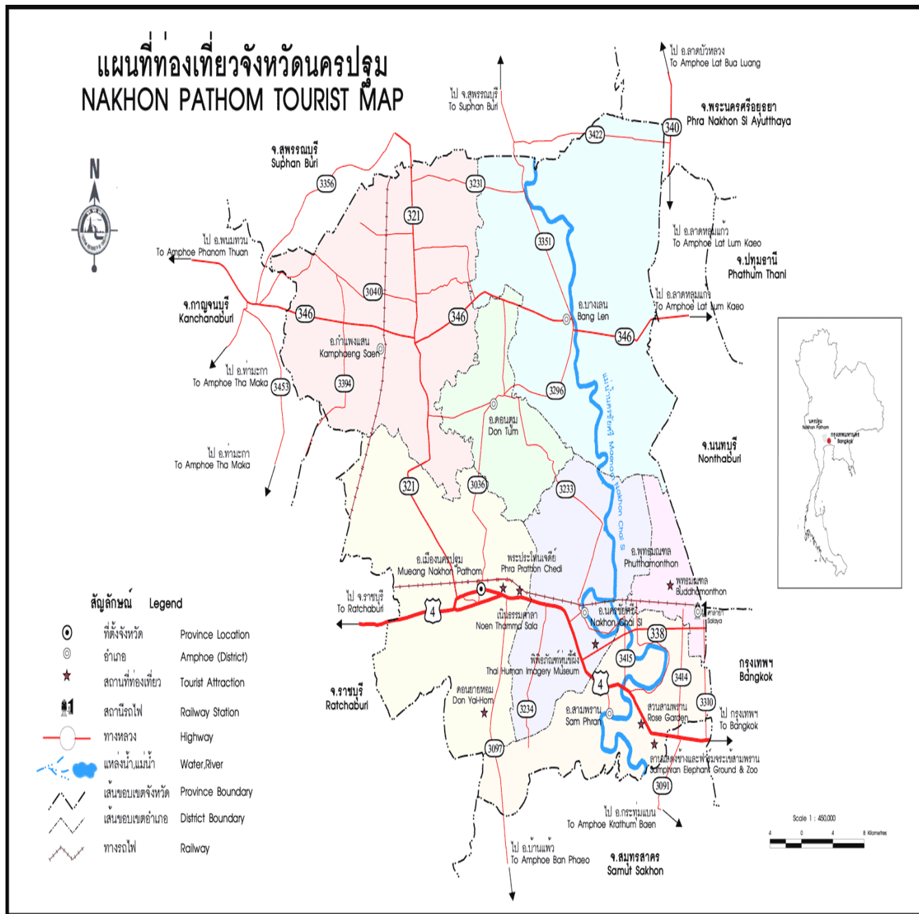
Fig. 1 Map of Nakhon Pathom