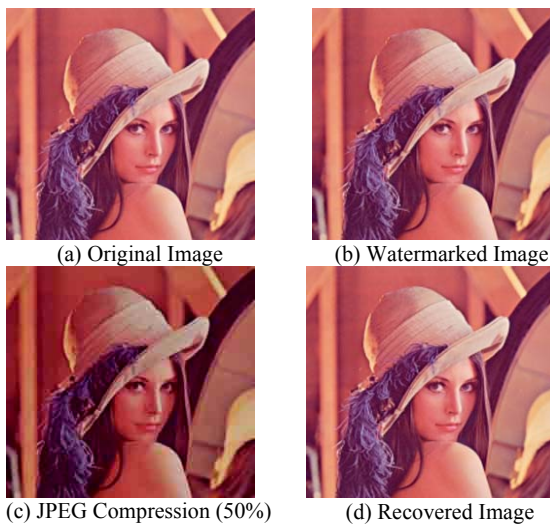
Fig. 5 Simulation Results: JPEG Compression

In Fig.5, caption (a), (b), (c) and (d) shows the original image, watermarked image, JPEG Compressed image and recovered image respectively