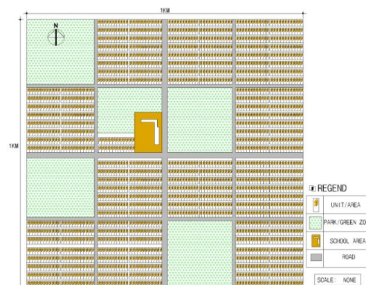
Fig. 1 A diagram of model case 1 land utilization plan.

Zγ is yearly energy consumption unit of buildings per each purpose (MJ/m 2 /year)