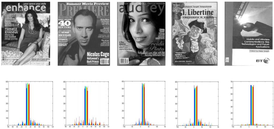
Fig. 4 Some other example of text extraction from proposed algorithm results and their histograms