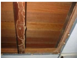
Termite infestation of ceiling Joist

Table I lists building defects that are commonly found in historical buildings in Malaysia. All such building defects may be recorded systematically in pictorial documentation, plans and elevations [7] which the QS may use to perform the quantity take-off for a bill of quantities (BQ).