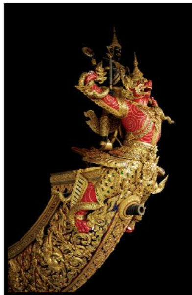
Fig. 2 The Royal Barge Narai Song Suban Ratchakan Thi Kao

Mostly "The Figurehead" symbolize as the creatures despite reality or Thai Himmapan mythical creatures. Almost every part of the barges made from teakwood, however, as it's became unapproachable, only part of the figurehead and keel of barges that made from teakwood. The rest made from Hopea wood which the original of the barges progression still remain [1]-[4].