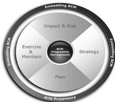
Fig. 2 Business Continuity Management Life Cycle Diagram (BS 25999-1:2006)

Maintaining a business continuity management program is an ongoing process of corporate discovery, risk management evaluation, strategy implementation, testing and review. International standards, like BS 25999, can help business continuity implementers set out guidelines to achieve these processes (Fig. 2) To help select an appropriate standard that best suits a company and its shareholders, the business continuity team should ask about the above issues [15].