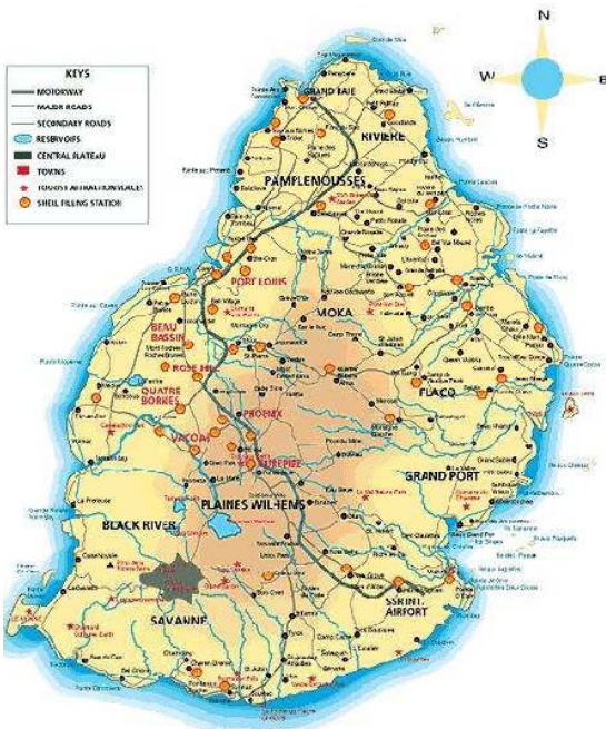
Fig. 1 Road Map of Mauritius