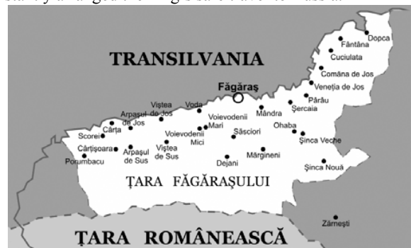
Fig. 2. Fagaras Country in its geographical relationship with Transylvania and Wallachia

a. The vicinity of the Romanians "beyond the mountains" with the Halicz principality, suggested by the fact that Otto, just released from prison (1308), expressed the desire to go to Halicz, but also by the reaction of the Romanian ruler, who instantly arranged the king's safe travel to Russia.