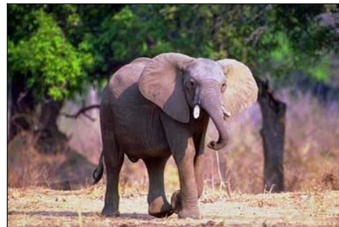
Fig.2. A sample image

We extract feature vectors of all blocks of image. Then, using a clustering algorithm such as k-means or SOM neural network, these feature vectors cluster into groups. In this work we use k-means algorithm to categorize the image blocks into k clusters. Each cluster represents a special object of the image. Then we select the m clusters that have largest members after clustering. The centroids of selected clusters are taken as image feature vectors (12-D vector for each centroid) and indexed into the database. In our experiments we sets k=10 and m=5. A sample image is depicted in Fig.2 and five representative features of the major objects are listed in Table 1.