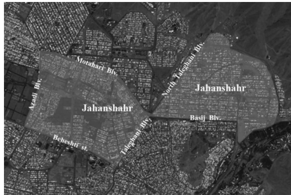
Fig. 2 Location of Jahanshahr neighborhood