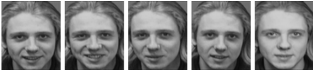
Fig. 2 Example of the images concerning one class

Matrixes \mathbf{X}_k were made of various sets of these vectors for each class. Number of vectors in matrixes was varied from 1 to 5 to reveal the dependence of recognition probability on the number of the elements in a class. Fig. 2 shows an example of five images of one person (class) on which one of 5600 \times 5 -matrixes \mathbf{X}_k was generated.