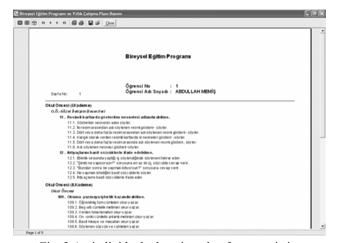
Fig. 3 An individual education plan for an autistic individual