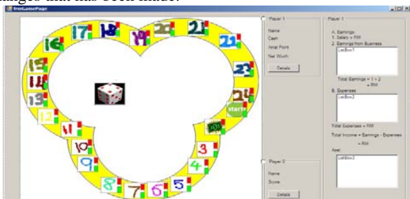
Fig.2 Screenshot of Second Prototype

Some of the feedbacks from Bistari Young Entrepreneur Sdn. Bhd regarding the current stage of the game are the dice inside the game does not resemble the real dice which have 12 sides, the layout of the level inside the game should resemble the real game because it is the symbol of the game, pictures are allowed to replace the wording inside the path layout, suggestion to include different level of difficulties of task as to accommodate different level of players, change the token that represent the players and too much pop up to display the task of the game. All of these feedbacks were considered and changes were made. Fig. 2 shows the screenshot of the changes that has been made.