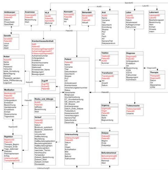
Fig. 1 Part of the TBase® data structure