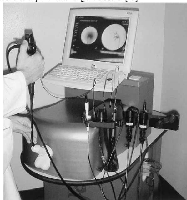
Fig. 4 Simbionix Uromentor Virtual Reality Simulator

Simbionix Uromentor endoscopic simulator is a VR device used for practising the basic endoscopic skill for novice endoscopists, shown as Fig.4. By using uromentor program, the number of parameter such as total procedure time, time to insert guidewire, incidence of mucosa trauma from the instruments, number of perforations and fragmentation time can be assessed. This assessment was evaluated by two experienced surgeon using global rating scale. The study led by Wilhelm showed that students who trained on the VR simulator gained improvement in endoscopic skills. This training allows a student to familiarize with instrumentation and also can enhance educational experience among the students [13].