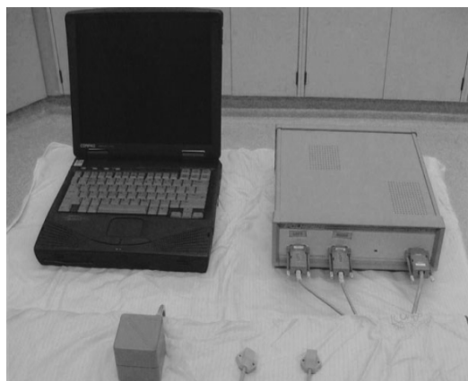
Fig. 2 Hand-motion analysis was recorded using Imperial College surgical assessment device (ICSAD) [9]

The Imperial College Surgical Assessment Device is a dexterity-based motion analysis device developed by the Department of Surgical Oncology and Technology by the Surgical Computing and Imaging Research Group [6]. The technology using electromagnetic tracking system (Isotrak II; Polhemus Inc, Colchester, Vt) is connected to a portable computer through a standard RS-232 (serial) port, independent motion acquisition software, and custom-made analysis software to track the surgeon's hand motion when performing a surgical task [6]. Two sensors are attached on the dorsal surface of the surgeon's hand as shown in Fig. 1. The positional data from trackers are recorded and analyzed in order to determine the number of hand movements, hand travel distance, direction, acceleration changes as well as the time taken to complete the task [7],[8]. This device has been shown to be a valid quantitative measure of dexterity in laparoscopic and open surgical simulation. Grober et al used this hand motion analysis as an objective measures of microsurgical performance [9]. The overall system is shown in Fig. 2. They asked the subjects to complete the several baseline microsurgical was assessed by expert using global