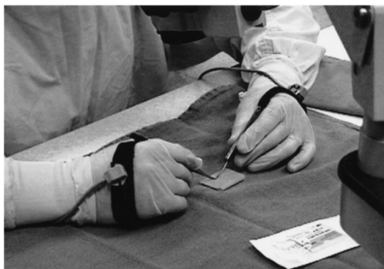
Fig. 1 Electromagnetic trackers placed on backs of microsurgeons' hands allowed positional data to be recorded and analyzed by computer software while subject performed a standardized microsurgical task [9]