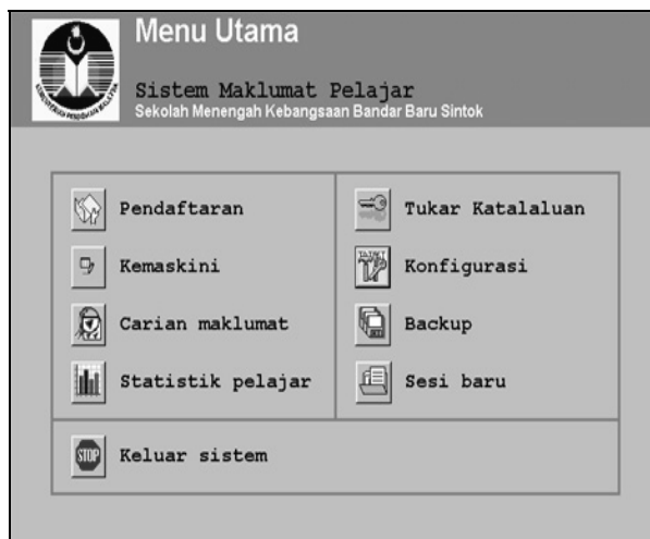
Fig. 1: Interface of SIS main menu

The information system is of a stand-alone type where it can only be used solely on a computer without having to connect to other computer as it is one of the requirements specified by the client. The system keeps record on students' details that includes personal information, co-curriculum activities and discipline. Meanwhile, the method of user interaction with the system is through filling out forms, accessing menus and buttons for direction. The users could search for students according to certain personal particular or co-curriculum activity through the search interface. The main menu interface of SIS is shown in the following Fig 1.