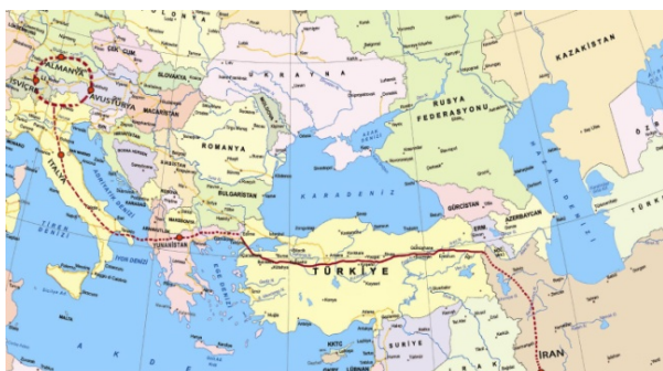
Fig. 2 ITE Pipeline Europe-Turkey-Iran route

The length of the ITE pipeline in Turkish territory is approximately 1790 km up to Türkgözü/Ipsala-Greek border. Pile diameter of ITE is planned to be 56 inches on land and 36 inches of two pipes for sea crossing at Canakkale Strait. Length of the pipeline crossing the sea shall be approximately 17km. ITE Project Planning Time;