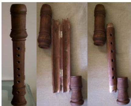
Fig. 2. Designed flute

The Fig 3 shows the implemented prototype of housing, which allows opening the main tube, to give the possibility to locate the electronics needed to operate.