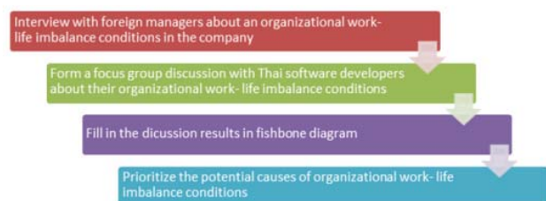
Fig. 1 Root causes analysis process

Many researchers in various fields have applied the fishbone diagram for its usefulness in terms of problem-solving or problem-based learning. In the food sciences and technology, Varzakas et al. [30] use this tool to detect causes of the accumulation of heavy metals in fresh vegetables, as well as the dangers in the stage of cooling, washing and disinfection, packaging and storage, and distribution. It is also useful for medical research. Fluker et al. [9] use fishbone diagrams as a tool in their study. It is used to identify barriers that obstruct exercise counseling in patients with hypertension in clinics. Wong [31] adopts fishbone diagrams for memory assistance and relevant medical case retrieval. In this study, a fishbone diagram is applied to discover potential causes of an organizational working life balance among Thai software developers working in a German-owned software company. The steps of fishbone analysis are conducted according to Fig. 1.