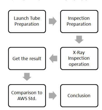
Fig. 1 shown research methodology

The research methodology was first applied by preparation of launch tube and inspection equipment, X-Ray Inspection. The operations for inspection with X-Ray then carried out for example marked inspection date/number, sticked IQI on film, attached of film and radiation source on launch tube, etc. Weld images would be occurred on X-Ray film and then primary judged for quality and qualify of each weld by certified body. The comparative evaluation according to AWS D1.1 had been obtained on next stage which would be secondary judged for decision which welds have to rework.