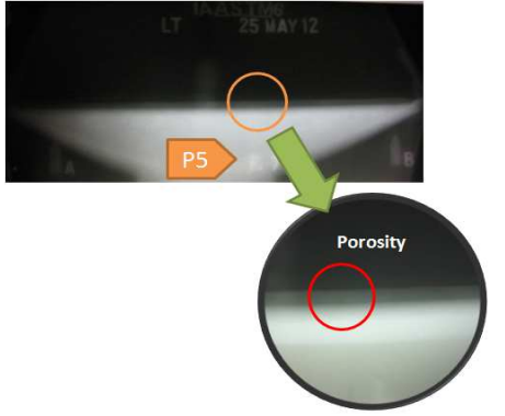
Fig. 7 Inspection result of position P5