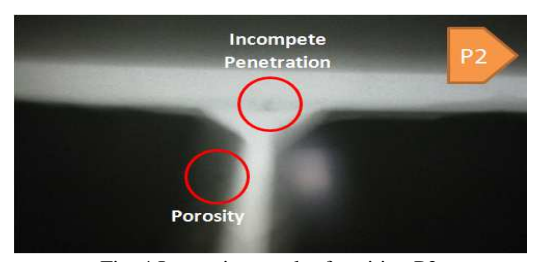
Fig. 4 Inspection result of position P2