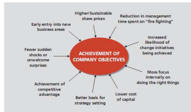
Fig. 4 Potential benefits of effective risk management and internal control

In the business world, a company's objectives and the environment in which it operates are continually evolving and, as a result, the risks that it faces also change. A sound system of internal control depends on a thorough and regular evaluation of the nature and extent of the risks to which the company is exposed. The systems and processes of control need to be sufficiently flexible to be able to change and adapt as the environment and the company's organization, objectives and activities develop over time [16].