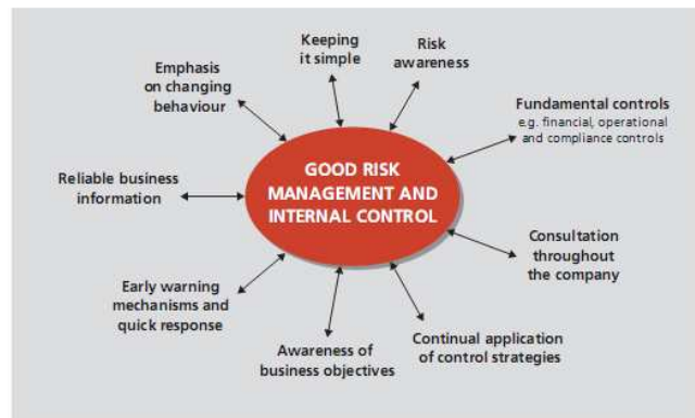
Fig. 3 Fundamentals of good risk management and internal control

events. The board must determine the type and extent of risks that are acceptable to the company, and strive to maintain risk within these levels. Internal control is one of the principal means by which risk is managed.