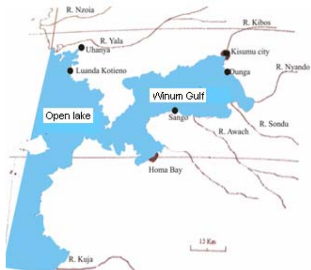
Fig. 1 Map showing the Winam Gulf (Kenyan part) and the selected fishing beaches. (Adapted from knowledge and experiences gained from managing Lake Victoria ecosystem LVEMP 2005, Mallya, G. Wambede, J.Kusewa, M.(Eds)

Lake Victoria is the second largest fresh water lake in the world, with an area of 69,000 sq km [16]. The lake is shallow with a maximum depth of 84 m, and a mean depth of 40 m. It has a catchment area of 193,000 Km 2 shared between Kenya, Tanzania and Uganda. Kenya owns 6%, Uganda 45% and Tanzania 49% of the total area. The basin supports over 30 million people. The major portion of Kenyan water of L. Victoria is a narrow gulf known to various authors by several names; the Victoria Nyanza, Kavirondo gulf, Nyanza gulf and Winam gulf. Winam gulf lies south of the Equator between 0°6' S – 0° 32' S and 34°13' - 34° 52' E at an altitude of 1134 m above sea level and covers an area of 1,920 sq. km (approximately 6% of whole lake) between 6 km and 30 km [16]. It has a catchment area of 3,600 km 2 drained by five major rivers (Nzoia, Kuja, Nyando, Yala, Sondu) through which it contributes approximately 30% of total riperrine inflow into L. Victoria [25]. It receives a mean annual rainfall of about 1,153 mm and experiences a mean annual temperature of 22°C and a mean annual potential evaporation of 1968 mm. Winam gulf experiences long rains from March to May with peak in April and short rains in August and October. Sample collection was done in four selected beaches, Uhanya to the northern end of the lake, Luanda Kotieno; an open inshore beach, Homabay to the southern end of the lake and Dunga beach in Kisumu city; a closed shore in industrialized area (Fig 1).