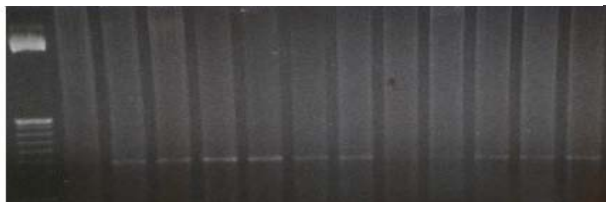
Fig. 2 PCR gel showing Malic acid dehydrogenase gene products for Salmonella . Isolates from Dunga (Lane 3, 4, 5 & 6), Uhanya (Lane 7 & 8), Luanda Kotieno (Lane 10) and Homa Bay (Lanes 11, 12 & 13). Molecular DNA maker 50bp (lane 1), Ø; negative control (lane 13).