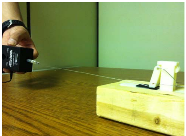
Fig. 3 The experimental setup to examine the locking mechanism

The full setup is shown in figure (3). A suture was placed under the peg and a current was applied to the SMA wire. The suture was then pulled by hand using a linear force gauge to record the highest force the suture was subjected to until it moved.