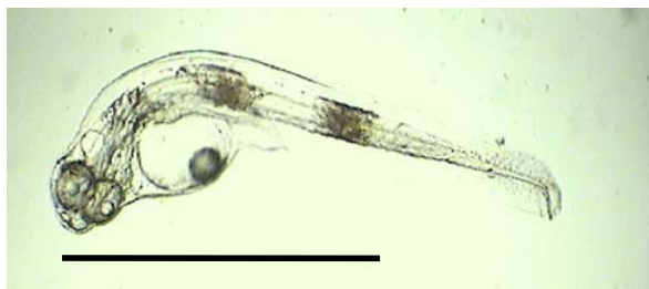
Fig. 2 A deformed R. sarba larvae at 18 hours post-hatch from the 28 °C treatment. The yolk sac and oil globule remain visible. This larvae which apparently suffered from a scoliosis-like deformity, swam in a circular pattern. Scale bar 1mm, mag. \times 4 .