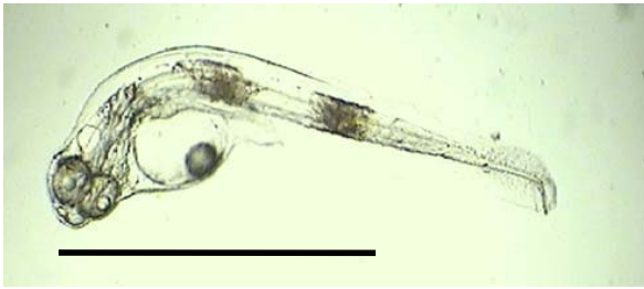
Fig. 2 A deformed R. sarba larvae at 18 hours post-hatch from the 28 °C treatment. The yolk sac and oil globule remain visible. This larvae which apparently suffered from a scoliosis-like deformity, swam in a circular pattern. Scale bar 1mm, mag. ×4.