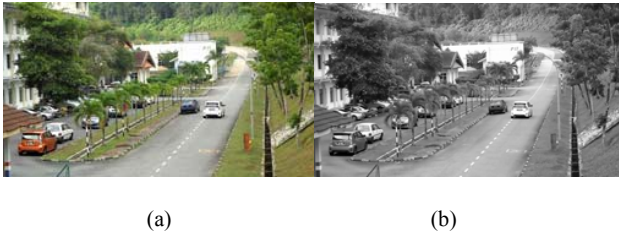
Fig. 1 Video images from CCTV camera from upper left: (a) captured event of image in colour (b) converted image in grey scale

This section highlights the overview of algorithm procedure in obtaining the estimated velocity of moving objects. CCTV camera with resolution of 25 frames/sec is used to operate the algorithm. Several steps are taken to process the captured images before determining the vehicle velocity. First, colored images are converted into grey scale. A reference background image from video stream is generated, as shown in Fig. 1 (a) and (b).