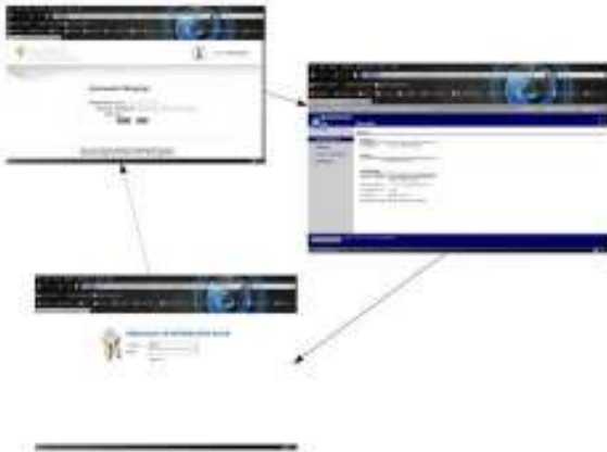
Fig. 6. VoiceMail: Sign-on