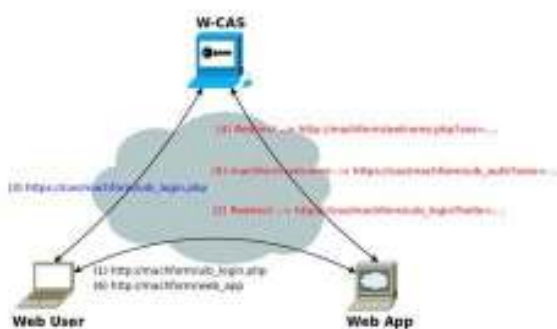
Fig. 5. MachForm: Authentication Mechanism

produced by login W-CAS:login and consumed by W-CAS:auth triggered by RESTful query from application server. The query is parameterized by the application name and W-CAS-Session . The key to decrypt W-CAS-Session is found in the configuration indexed by the supplied application name.