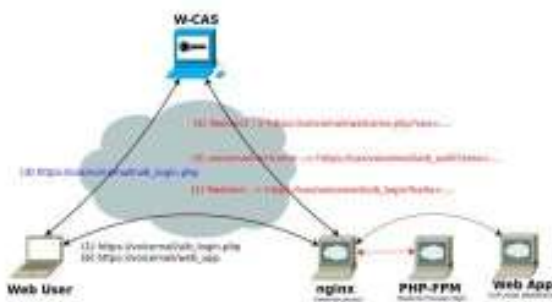
Fig. 7. VoiceMail: Authentication Mechanism

behaves of the user by sending either a HTML GET method or HTML POST method to the application's sign-on URL with all the needed credentials.