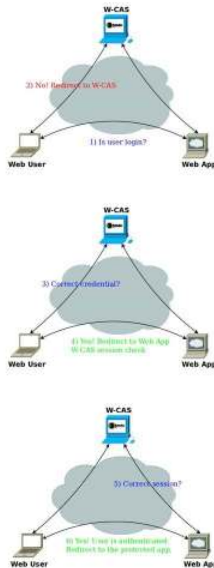
Fig. 3. W-CAS: Sign-on

One way to reduce the risk of credentials being stolen by phishing is to provide enterprise users with one and only one secure sign-on site for all enterprise Web-based application authentication procedures. The users will be informed and educated about the sign-on URL (Uniform Resource Locator),