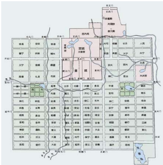
Fig. 1 The City of TangChang'an, represent li fang

continued, which the enclosed residential area of ordinary people was called li fang since the Sui Dynasty. Along with the economic growth in the Tang Dynasty, the residential form of li fang gradually disintegrated, coming into being the form of fang xiang in the northern Song Dynasty. However, the differentiation of residential areas did not collapse according to the hierarchical system.