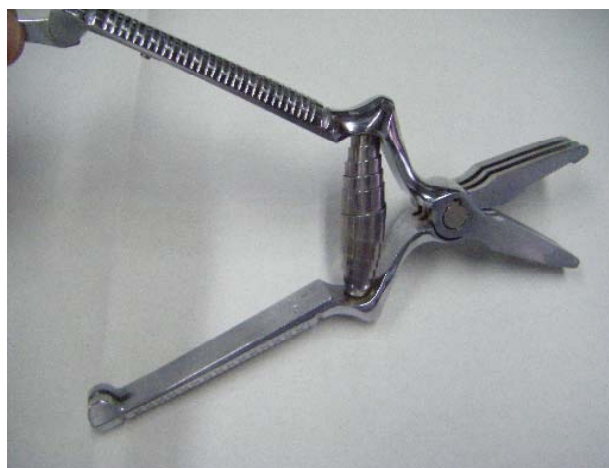
Fig. 1 Manual device used in this study for grinding the coated fish stick products

Six samples of each group were assayed at three different temperatures, 37 \pm 1 °C, 50 \pm 1 °C and 80 \pm 1 °C.