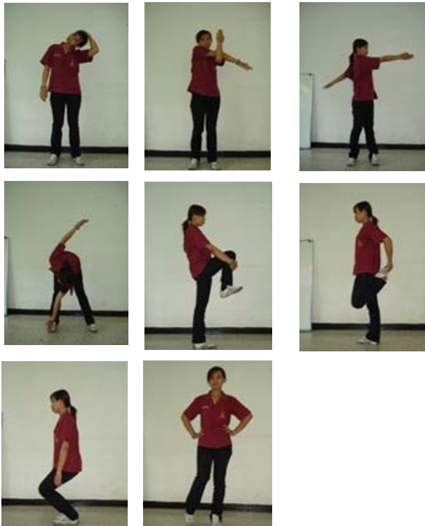
Fig. 3 Eight Postures for Flexion and Extension Muscle for left and right side

The flexion and extension postures was using to relief injury of 4 muscles (neck muscles, arm muscles area, muscles on the back and lower back muscles), as shown in figure 3. The workers practiced 15 minutes before the beginning and the end of work for 5 days.