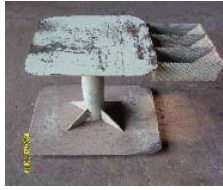
Fig. 1 The existing workstation for sewing sack procedure