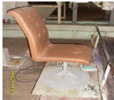
Fig. 2 The probability optimized workstation for sewing sack procedure

B. Risk Assessment of Worker Postures The present study assesses risk score of work postures by RULA and REBA when the operators applied the old and the probability optimized workstation.