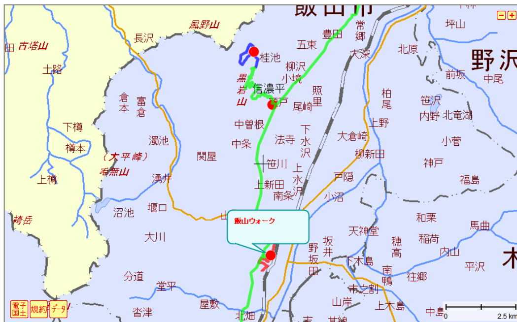
Fig. 1 Route for Activities at Shinanodaira, Iiyama-shi, Nagano for Learning Material (Denshi Kokudo Web version)