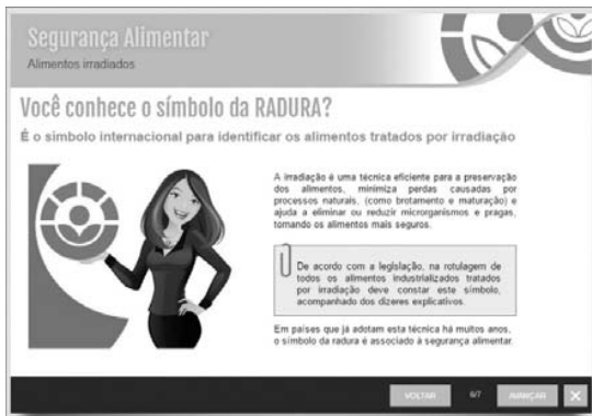
Fig. 2 Informing the general public: concepts about food irradiation

visitor. According to the equipment and resolution of the screens, the layout automatically adjusts for best viewing and better use of educational resources designed for the transmission of each content, as seen in Fig. 4.