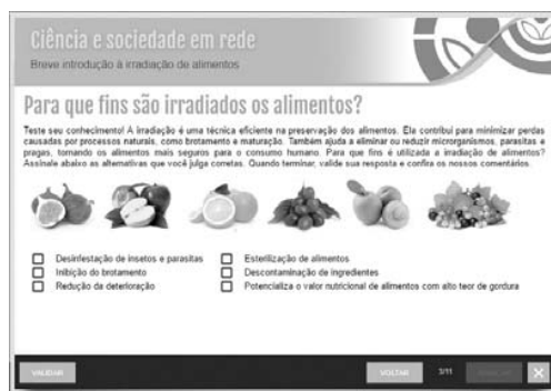
Fig. 3 Interactive exercises to check public's previous knowledge