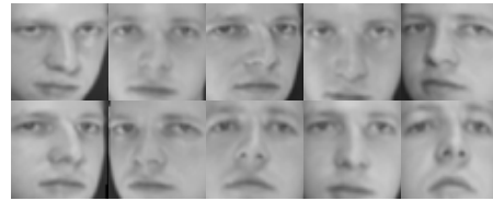
Fig. 1 Face images of ORL database

We have applied the proposed method above (WHT) using human face image database from AT&T Cambridge laboratories in UK created at the Olivetti Research Lab (ORL) prospected in web sites in [7] [8]. The database contains 40 classes of persons, each person is represented by 10 images with different pose. There are 4 females and 36 males, and the size of each image is 48 \times 48 pixels, with 256 gray levels per pixel [17]. Fig. 1 shows samples of the database.