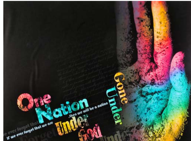
Fig. 2 "One Nation" poster design by an Iranian student

"I would like to thank our dear dean for his support and also for all of our lectures in foundation. We have learned a lot from you and it was a very special year for us. Everybody did a great job and we are proud to be FCM students" .