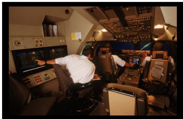
Fig. 2 Example interior of a Full Flight Simulator of Air France-KLM, Vilgenis training center (Massy-Palaiseau, France)