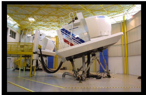
Fig. 1 Example exterior of a Full Flight Simulator of Air France-KLM, Vilgenis training center (Massy-Palaiseau, France)

illusions of acceleration, deceleration, and turning (but not looping!). These high fidelity simulators are expected to give the trainees a high level of contextualization of the simulated situation, it means a simulated situation as much close to the real operating situation as possible so that the trainees may feel the real operational context on simulator. When qualified on simulators, the pilots must take qualification tests on real flights, and when this is achieved, they co-pilot for several years with more experienced pilots, the captains, before becoming themselves captains.