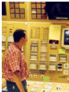
Fig. 4 Hybrid simulator developed by GSE Systems for nuclear reactor control rooms: the three boards are scale 1 on-touch screens and all components are virtual

What becomes then embodiment when all is virtual, when trainees do not have any more this relationship with equipment that helps them to feel the industrial process? A part of the answer is to design the professional training with embodiment elsewhere than on the virtual simulator. Yet, to know how to integrate embodiment elsewhere, it means in another part of the global professional training, training designers must know why, how and what they lose through embodiment and what changes they create for trainees whilst training on virtual simulators instead of full scale high fidelity simulators. While this question is crucial, very few studies are available about it (see the recent study [3]), perhaps because either the question