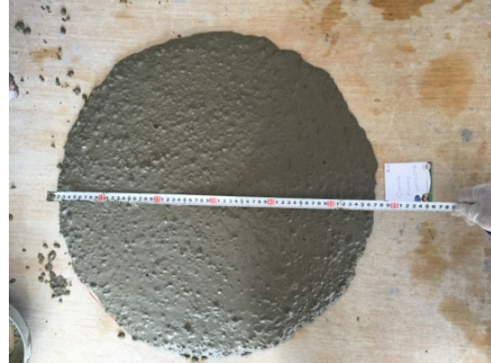
Fig. 3 Flow and T 50 time testing

According to EFNARC, there are two different T 50 time classifications for SCCs: VS1 and VS2. According to this report, VS1's T 50 time should be ≤ 2s and VS2's T 50 time >2s. According to T 50 time test results, T 50 time values of self compacting lightweight concretes were measured between 4 and 9 s. As seen in Table VIII, all mixes are in limit of VS2. According to the test results, use of waste marble was positive affect the workability of self compacting lightweight concrete.