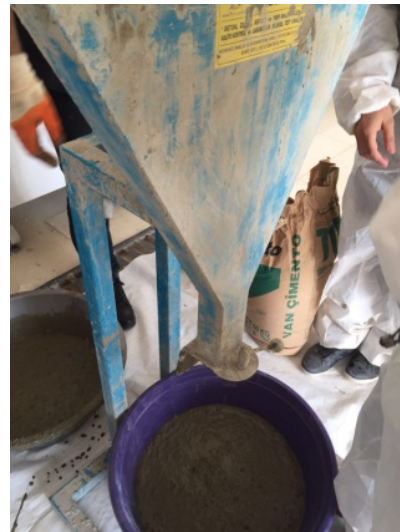
Fig. 4 V funnel test