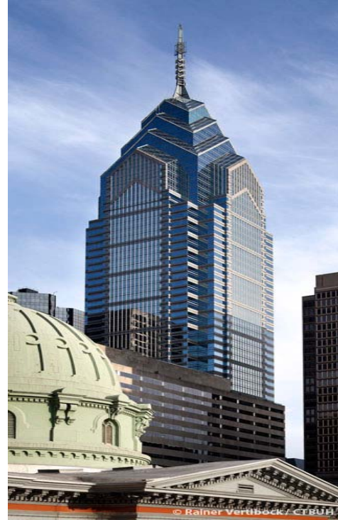
Fig. 4 One Liberty Place [23]

The bundled tube system can be visualized as an assemblage of individual tubes resulting in multiple cell tube. The increase in stiffness is apparent. The system allows for the greatest height and the most floor area. This structural form was used in the Sears Tower in Chicago Fig. 1. In this system, introduction of the internal webs greatly reduces the shear lag in the flanges. Hence, their columns are more evenly stressed than in the single tube structure and their contribution to the lateral stiffness is greater (Fig. 7) [18].