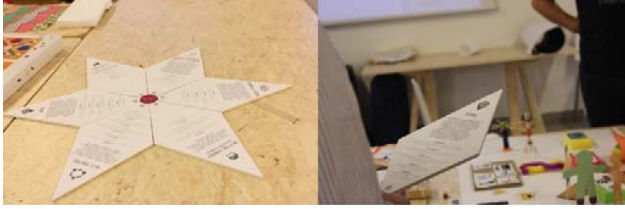
Fig. 3 DiDIY Factor stimuli tool used during the "Make it Real" activity

way, people can add new factors and replace others keeping the tool always up to date. As the six-pointed star concept, the hexagon also gives the same ideas of union in the central part. Only the simultaneous implementation of all factors can generate the desired innovation in digital-enabled projects.