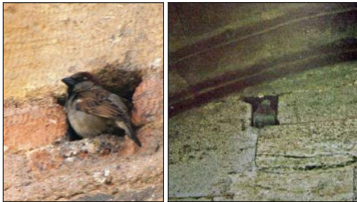
Fig. 1 Cell type dovecotes [5]

The first type of the bird houses are structures that can be found at any surface without any excessing parts outside (Fig. 1-2). These are built up by cavities, that are formed on the surface and dimensioned by bird sizes, either alone or a few cavities lined side by side or downwards. The ones which are made of stone are more common. However, there are types where brick and wood is used together. The best examples of this type are the bird houses of İstanbul Süleymaniye Mosque, İstanbul Yeni (New) Mosque, Üsküdar Yeni Valide Mosque, Üsküdar Ayazma Mosque [3],[4].