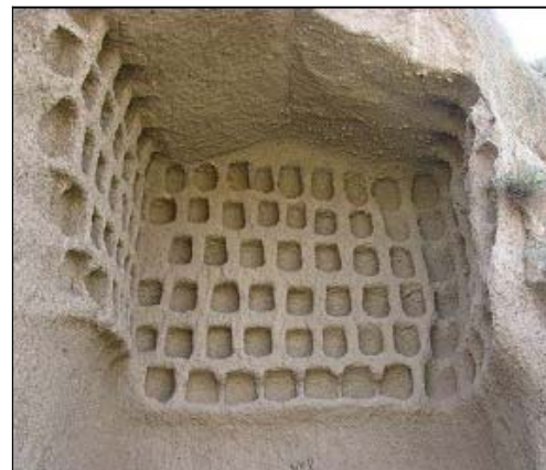
Fig. 10 Rock carved dovecotes at Ani ruins, Kars [13]

The rock-carved dovecotes are also seen in Ani ruins in Kars. The dovecotes at Ani are built by carving the rocks around Bostan River (Fig. 10). The dovecotes show different plans due to the position and dimensions of the rocks. As the bird houses show a neat work and are made of little rectangular equivalent spaces, it is thought that they are made by Ani artists with a special purpose. The bird houses at Ani show that communications by birds are used at Ani [13]. The rock-carved dovecotes are also found on the entrance of the underground cities (Fig. 11) [14].