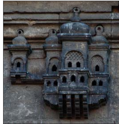
Fig. 4 Üsküdar Ayazma Mosque [6]