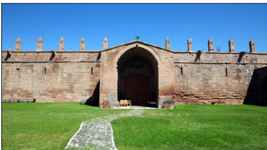
Fig. 7 Bursa Yenişehir Sinan Paşa Kulliyeye [2]

Developed by a different process than the other two types, there is a third type of bird houses on the chimneys. This different process is the use of chimneys as bird houses with the change of the function. These come as variations of one cell on the facade or more than one cell on the facade. Bursa Yenişehir Sinan Paşa Kulliyeye (Fig. 7) Public Kitchen chimneys remaining from 16th century and Merzifonlu Mustafa Paşa Palace chimneys in İncesu, Kayseri can be given as examples [2].