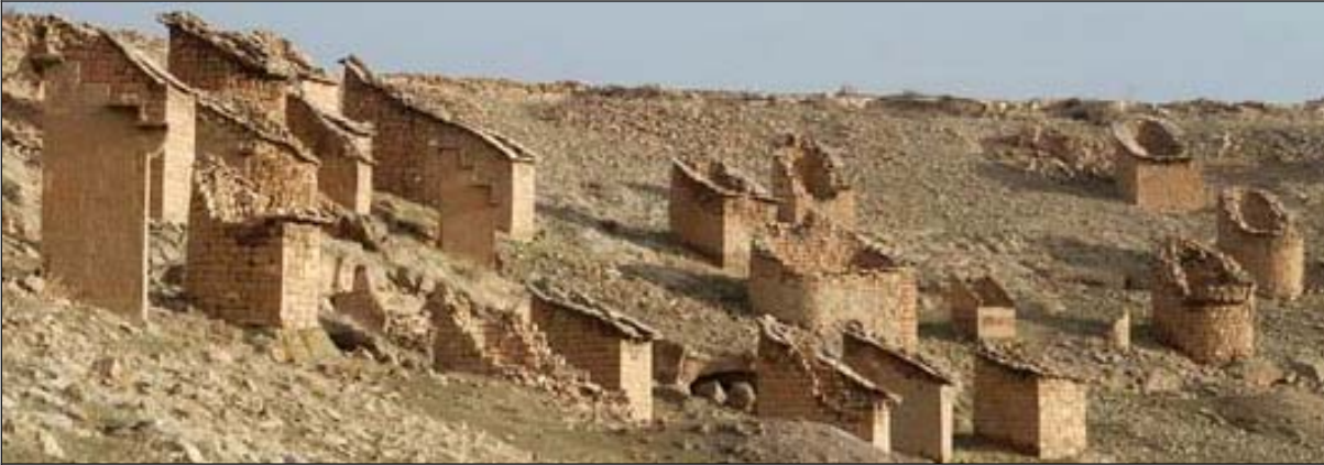
Fig. 12 The dovecotes with chimneys at Nevşehir region [8]

the pyramidal roofs are unique and important properties special to the region. The walls of the structures have roost niches and the ground is decorated with water bowls. There is large manure collecting and storing areas either rectangular or disorderly planned, related to the dovecotes [15].