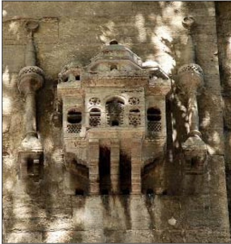
Fig. 6 Üsküdar Yeni Valide Mosque [6]

Bird houses can be grouped as: cladded on stone walls, stone carved, stone relief, framing on alternating walls, cladded on alternating walls, stone facade cladded on alternating walls, brick facade cladded on alternating walls, carved on alternating walls or constructed with plastering techniques [2].