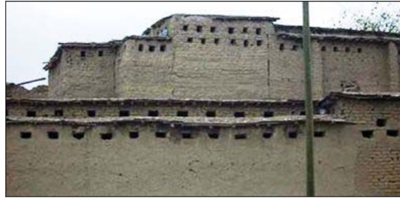
Fig. 17 Dovecotes at Diyarbakır [19]