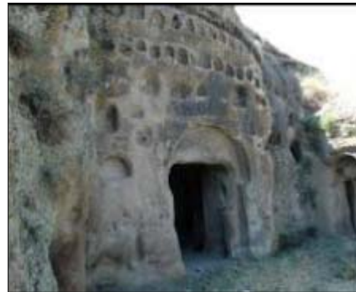
Fig. 11 Rock carved dovecotes on the entrance of underground cities [14]