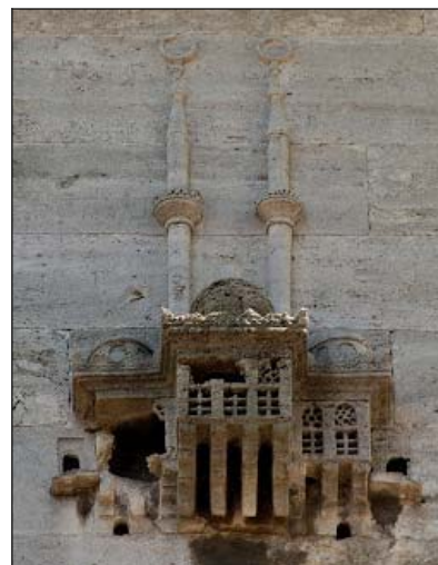
Fig. 5 Üsküdar Yeni Valide Mosque [6]