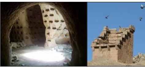
Fig. 13 The interior space use in dovecotes with chimneys [8]

The dovecotes are made up of functional units, like chimneys, pools, nests, feeding platforms and sun bathing eaves organized in a specific order. The structures, where only manure collecting for producing buckthorn, the important agricultural product of the times, is planned, are constructed with local materials and in harmony with the region's topographic characteristics (Fig. 14-15) [10].