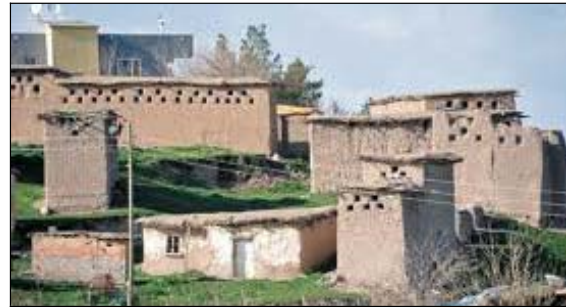
Fig. 18 Dovecotes at Diyarbakır [20]

After the spreading of artificial manure in Turkey in 1950's and 1960's, the need of dove manure had decreased both in Kayseri and in Diyarbakır and the dovecotes had lost their function.