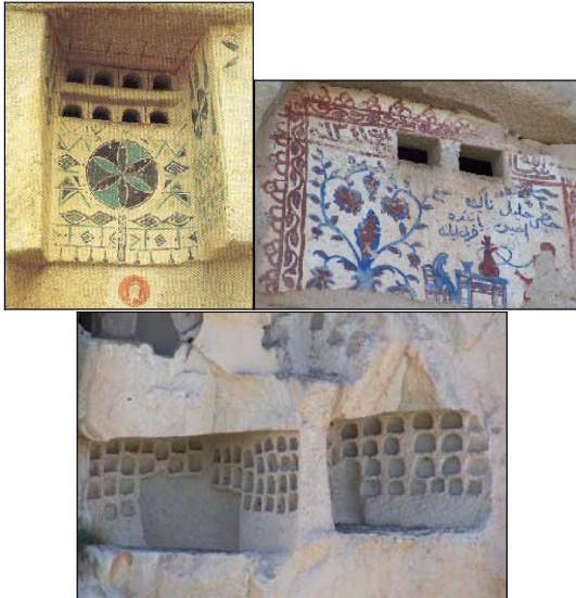
Fig. 8 Rock carved dovecotes in Cappadocia [10]

decorating the outer surface of the dovecotes are obtained from the soil which is called as “yoşa” in the region, containing wild weeds and iron oxide. The four tonnes of green are obtained from walnut shell and leaves, yellow from buckthorn, dark red from dried grapes, pink from onion tunic, brown from alder shell and cow urine is used to give glow [9].