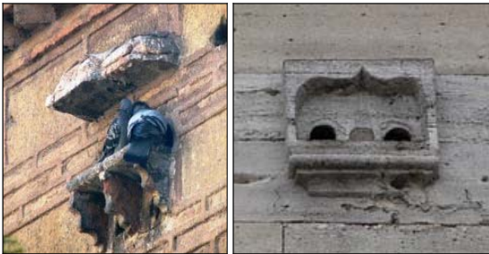
Fig. 2 Extension type dovecotes [6]