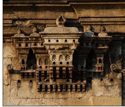
Fig. 3 Üsküdar Ayazma Mosque [6]

Different types of bird houses can be seen on the same mosque. As an example, on the Üsküdar Ayazma Mosque there are four types of bird houses of different properties (Fig. 3-4).