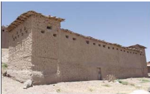
Fig. 16 Dovecotes at Diyarbakır [19]

The people farming in the rural areas of Diyarbakır, made a dovecote near or on a higher place while constructing their houses. The aim is primarily to obtain dove manure. The manure collected from the dovecote every year, is used in agriculture. There are dove entrance holes at a high point, near the roofs of outer surfaces of these buildings. These holes refer to different directions. However, the entrance holes, which are closer to ground on a sloped area, are closed to prevent the entrance of various animals and to prevent against the wind. Usually one of the main facades of the dovecotes is directed to the scenery. The numbers of dove entrance holes are usually more on this side. The simplest of these rectangular shaped spaces are the ones with one room. This place called “one roomed dovecote”. Partitions are called as “lüle” in the local language. The dovecotes in the Karaçan village usually are made of one, two, three or five lüles. To develop a bigger dovecote, there is an example having more partitions. The building material used gives opportunities for these additions. Usually the walls of these rectangular dove shelters are made of adobe. These walls averagely 55 cm in width and four meters of height are even wider till one meter height from the ground. The roof covered with earth is flat [17], [18].