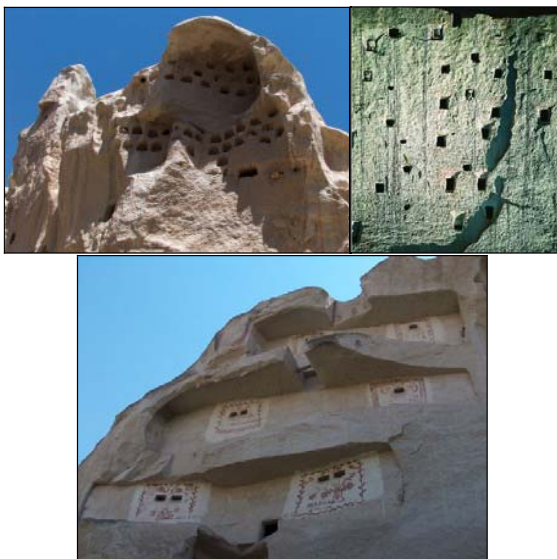
Fig. 9 Rock carved dovecotes in Cappadocia [11], [12]

The decorations carrying marks of the emotions, thoughts, messages and creativity of the local artists, are dated to 18 th and 19 th century. The figures of men smoking water pipe and people dancing a local dance of “kılıç-kalkan” are noteworthy among the simple and mystical figures of the Cappadocian artists. On the dovecotes of Göreme, Çavuşin and Zelve