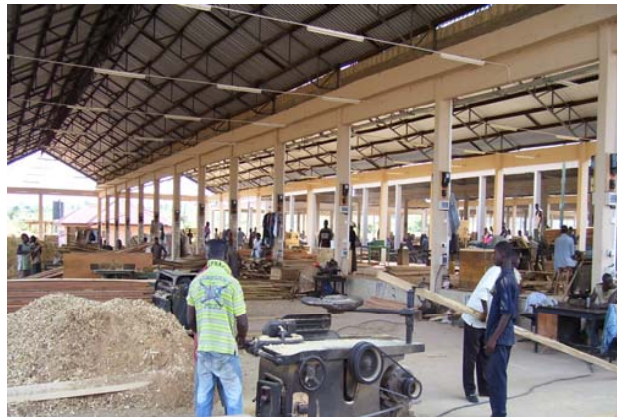
Fig. 1 Wood workers at the SWV, Kumasi

Geographically, the SWV is located in the Nhyeaso Sub-Metropolitan Area of the Kumasi Metropolis (see Fig. 2). This ultra-modern wood village occupies about 12 hectares and was designed to accommodate about 4,790 workers engaged in wood related SMEs. The construction of the facility was jointly funded by the French and Ghanaian governments at a cost of about US$10 million [17], [18]. The objective of SWV development was to enhance the productivity, the working and the living conditions of the wood workers [18]. Available facilities and services in the SWV include electricity, pipe borne water, toilet facilities, road networks, a health post, a security post, a bank and an insurance firm.