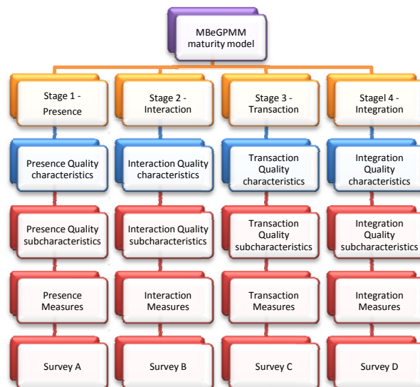
Fig. 2 Components of MBeGPMM

The MBeGPMM is a hierarchical model with 5 levels. The first level is composed of four maturity stages as the following: presence, interaction, transaction and integration. Each maturity stage contains quality characteristics related to the corresponding maturity stage in the second level. Furthermore, each quality characteristic is composed of one or more quality sub characteristics in the third level. Moreover, each quality sub characteristic can be measured using one or more measures that can be in the form of a user survey in the fourth and fifth levels. Fig. 2 shows the components of the proposed MBeGPMM.