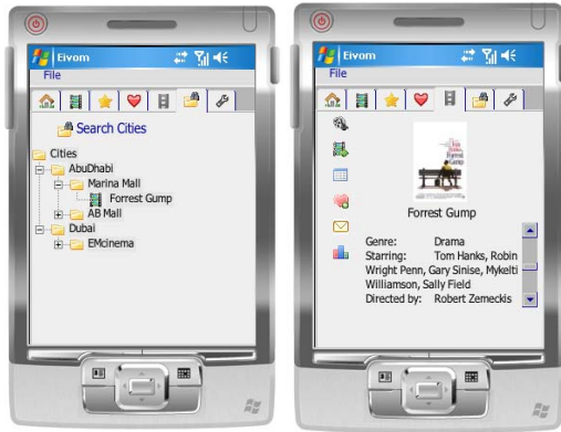
Fig. 3 Search cities and movie information snapshots

We have implemented most of the system features such as search cities, search movies, user bookmarks, user cinemas, movie premier, stream movie trailer, movie details, movie schedule time, offline access to the application, buy tickets, tell friend about movie and rate movie. Fig. 3 shows examples of some implemented features.