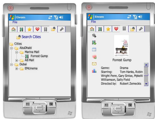
Fig. 3 Search cities and movie information snapshots

We have implemented most of the system features such as search cities, search movies, user bookmarks, user cinemas, movie premier, stream movie trailer, movie details, movie schedule time, offline access to the application, buy tickets, tell friend about movie and rate movie. Fig. 3 shows examples of some implemented features.