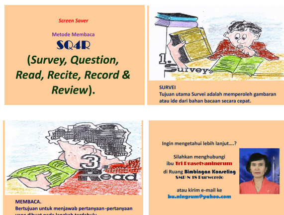
Fig. 3. Some displays of Screensaver "Learning Guidance"