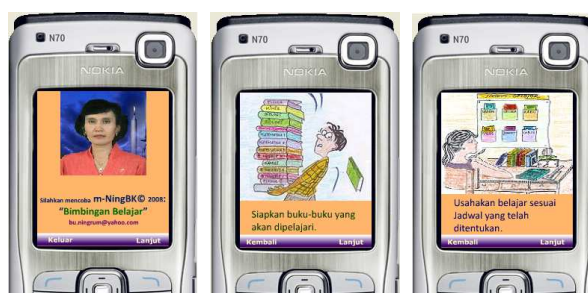
Fig. 2 Content services on the application of m-NingBK ©: "Learning Guidance"

ICT applications content that have been developed as shown by Table I.