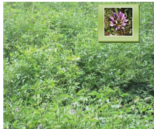
Fig. 1 Bituminaria bituminosa