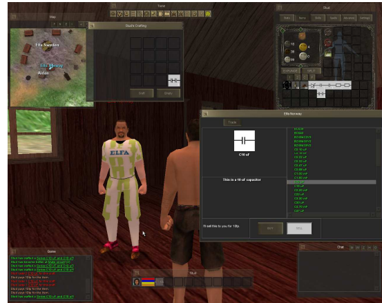
Fig. 3 In the shop

The next natural step is to assemble the differential amplifier, although any of the three next steps can be done in any order. The differential amplifier is assembled in two steps. First two identical transistors are combined with a resistor. This resistor will be the common emitter resistor for the two transistors. This assembly gives a new unit, which in turn can be combined with two identical resistors that gives the two collector resistors.