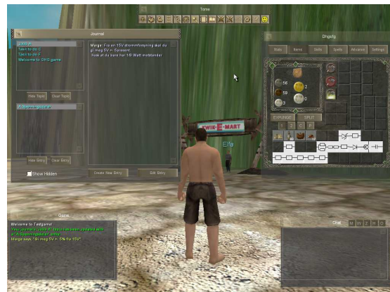
Fig. 4 Working on assignment

Below are shown some screenshots from the shop. Fig.3 shows the student acquiring components from the shop. These components are later used in the construction of circuits. The other windows shown are starting top right and going clockwise: map, crafting, inventory, shop, chat, macros and messages from the system. Fig.4 shows the journal, specifying the current task, and their work window (Inventory).